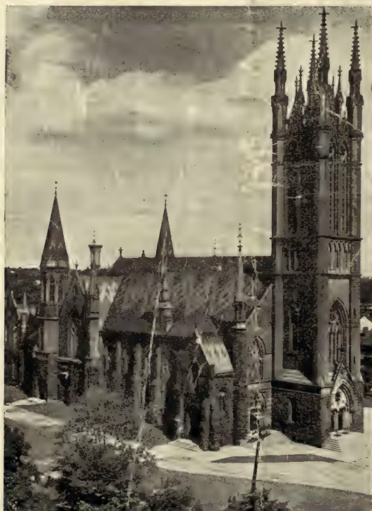
THE METROPOLITAN WESLEYAN METHODIST CHURCH AS IT APPEARED ON ITS COMPLETION IN 1872 AND AS IT STANDS TODAY.